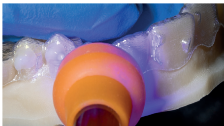
10 sec light-curing through the transparent template