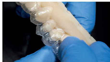
Removal of the template after light polymerization