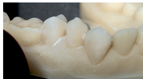
Final situation after removal of all residues