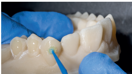
Preparation with standard etching and bonding protocol