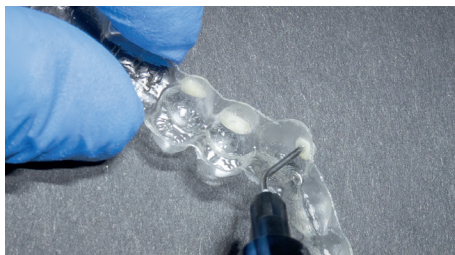
Application of AlignerFlow LC into the template