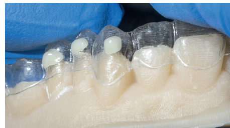
Insertion of the template