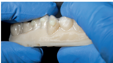
Template put into place