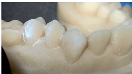
Treatment completion: residues are visible under UV-A light