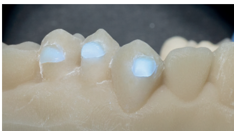
Finished attachments under UV-A light